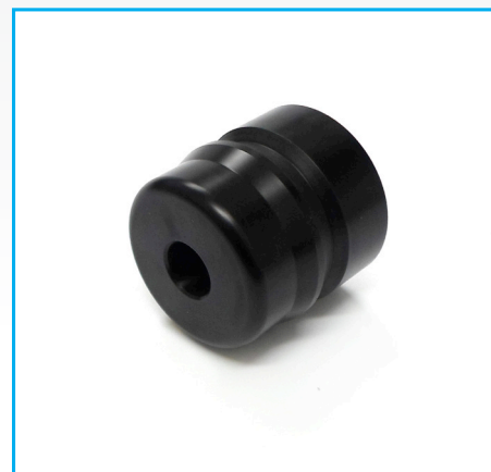
SHC308-18 - Dummy Male