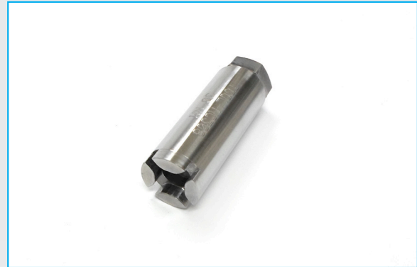
HC308-TOOL - Service tool